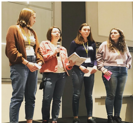
IBPA Conference 2019

Youth Vote has a local mission with global significance. Members have presented their work in civic education, bullying prevention, and meaningful youth engagement all over the US and internationally. This month Youth Vote will present a 4 hour workshop to educators from across the country at Deeper Learning 2022. Youth Vote's presentation "Youth Voice to Save the World" will guide participants as they create youth-led campaigns to support the issues young people care about. Youth Vote also hopes to present at the LWVUS Convention for the third time in June.